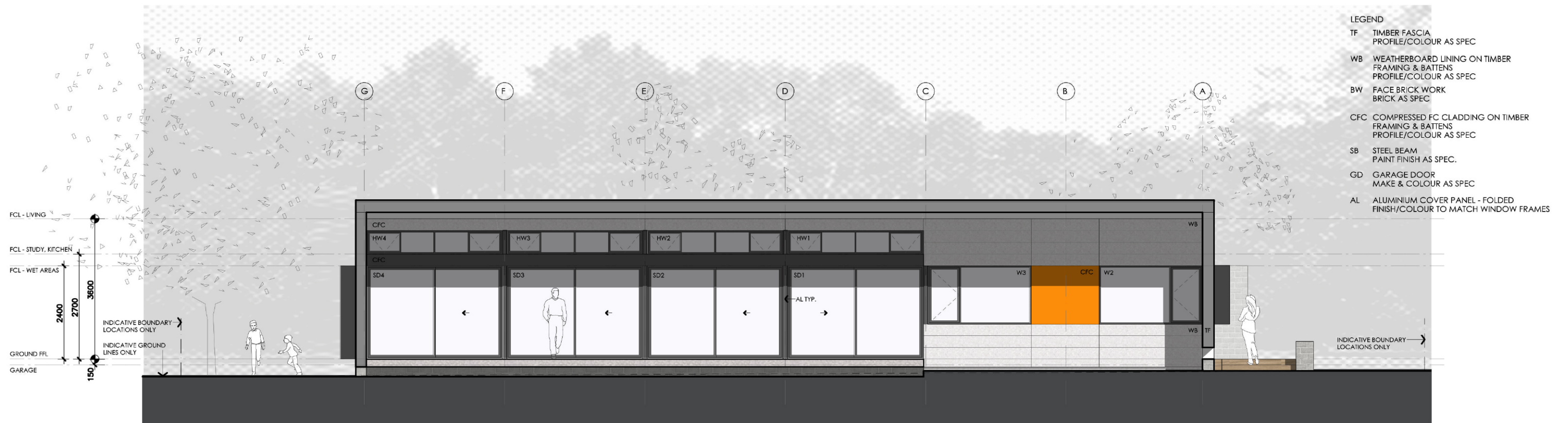
01 | NORTH ELEVATION 2A201_1 1:100