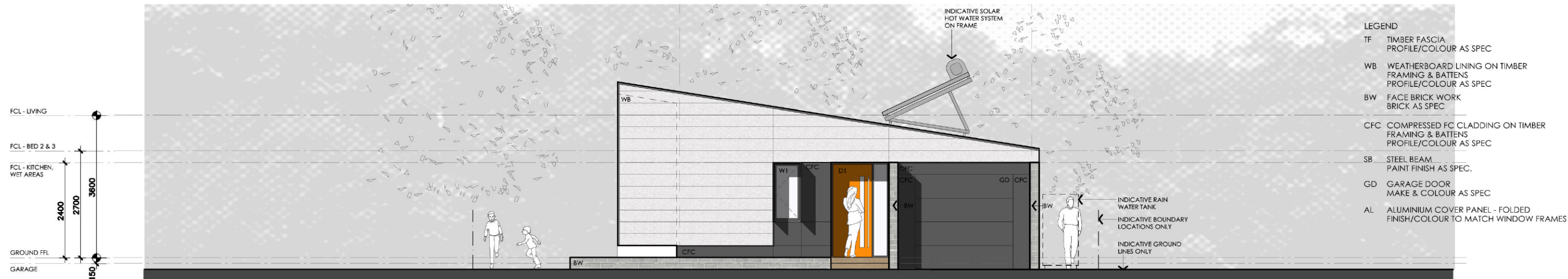
01 STREET ELEVATION - 1A TYPE 1