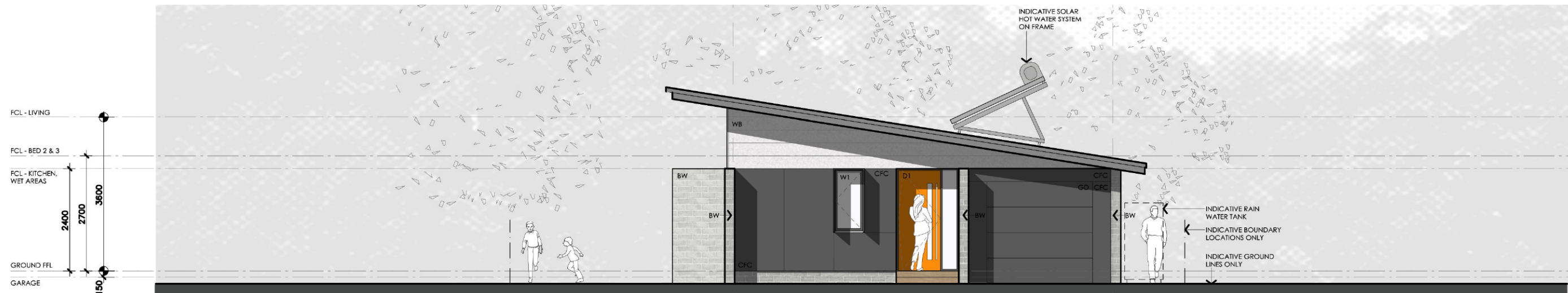
02 STREET ELEVATION - 1A TYPE 2