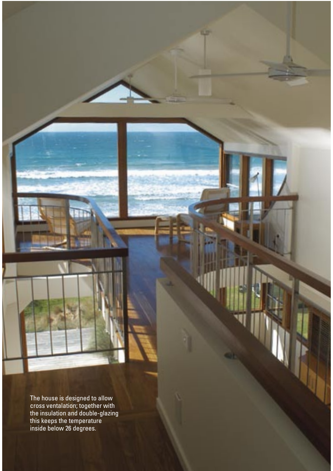
The house is designed to allow cross ventilation; together with the insulation and double-glazing this keeps the temperature inside below 26 degrees.

sensitive design and philosophy as the house. The shared driveway has been laid with Hume BG slabs (concrete grass pavers) interspersed with lawn. Seventy per cent lawn to 30 per cent block reduces run-off and heat reflection. The garage has been covered over with fill from the site excavation, then planted with native grasses and creeping pigface. "Garages are often a blight on the landscape, especially on the coastal landscape," says Bradford. "The earth-covered garage was an attempt to minimise its visual impact."